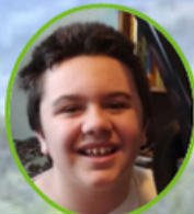
Troy, 8th grade