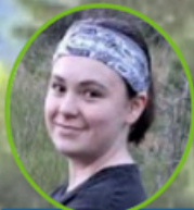
MJ, 11th grade