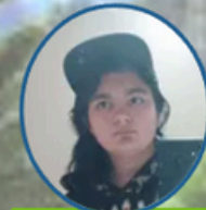
Ham, 9th grade